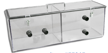
Item #55215 Anesthesia Chamber, Large Size: 21" x 7" x 7"