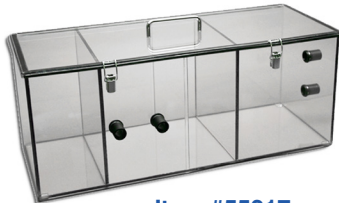
Item #55217 Anesthesia Chamber, Magnum Size: 23" x 9" x 9"