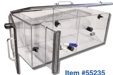
Item #55235 Anger Management Chamber Size: 23" x 10" x 9"