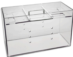
Item #55220 Wild Child™ Chamber

Wild Child™ and Wild Child™ II Chambers are the positive, professional management tool used to assist veterinarians and staff in handling fractious cats and other companion animals safely and humanely. Made of clear, durable polycarbonate allowing veterinarians and staff the ability to view the secured patient during procedures. Provides clinic staff a proven method in handling patients, reducing potential trauma to patient and staff. May be cleaned with most antiseptics (unlike acrylic chambers). An essential tool in any veterinary clinic.