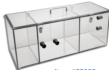
Item #55255 Anesthesia Chamber, Magnum - 4-Latch Size: 23" x 9" x 9"