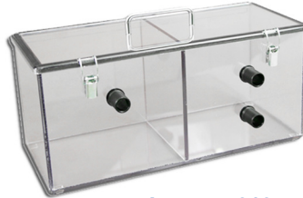
Item #55212 Anesthesia Chamber, Small Size: 16" x 7" x 7"