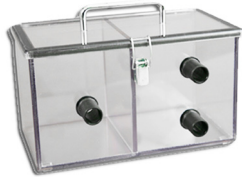
Item #55205 Anesthesia Chamber, Mini Size: 10" x 5-1/2" x 5-1/2"